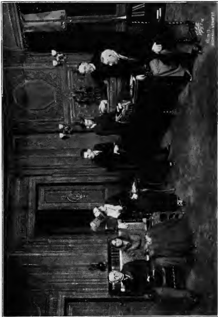
THE DAMAGED GOODS OF THE GREAT HUMAN CARGO